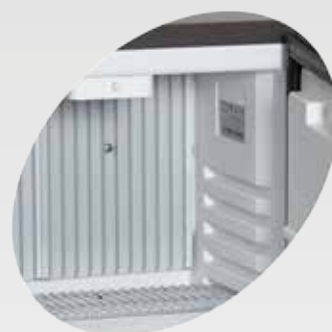
New design increases net volume.